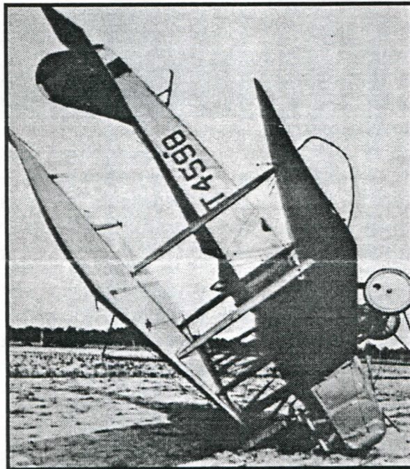
On the nose for landing and mail delivery. The versatile Jenny did it all as a trainer, barnstormer and mail plane. This was an unfortunate landing in 1918.

This chronology of Maine's Air Mail history was reprinted with kind permission from Strut & Axle, quarterly journal of the Owls Head Transportation Museum in Owls Head, Maine. The article originally appeared in the Fall 1996 issue.