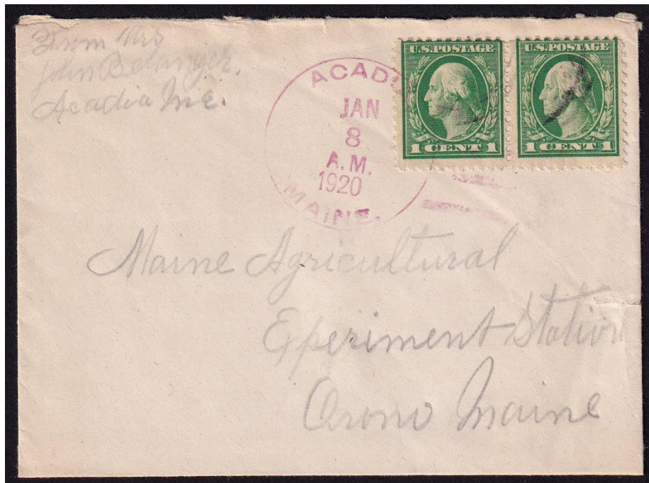
8 January 1920: The circular postmark is 32 mm in diameter with partial target killers. Another similar postmark on a cover dated 21 November 192? with red ink is known to exist.

31 May 1927: Acadia post office closed – service from Caribou.